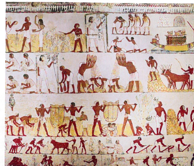
This painting shows peasants cutting and gathering the wheat harvest.

But farmers could also be punished for a poor harvest. They had to pay taxes in the form of crops. If a harvest came up too short to pay the required tax, a farmer might be brutally beaten.