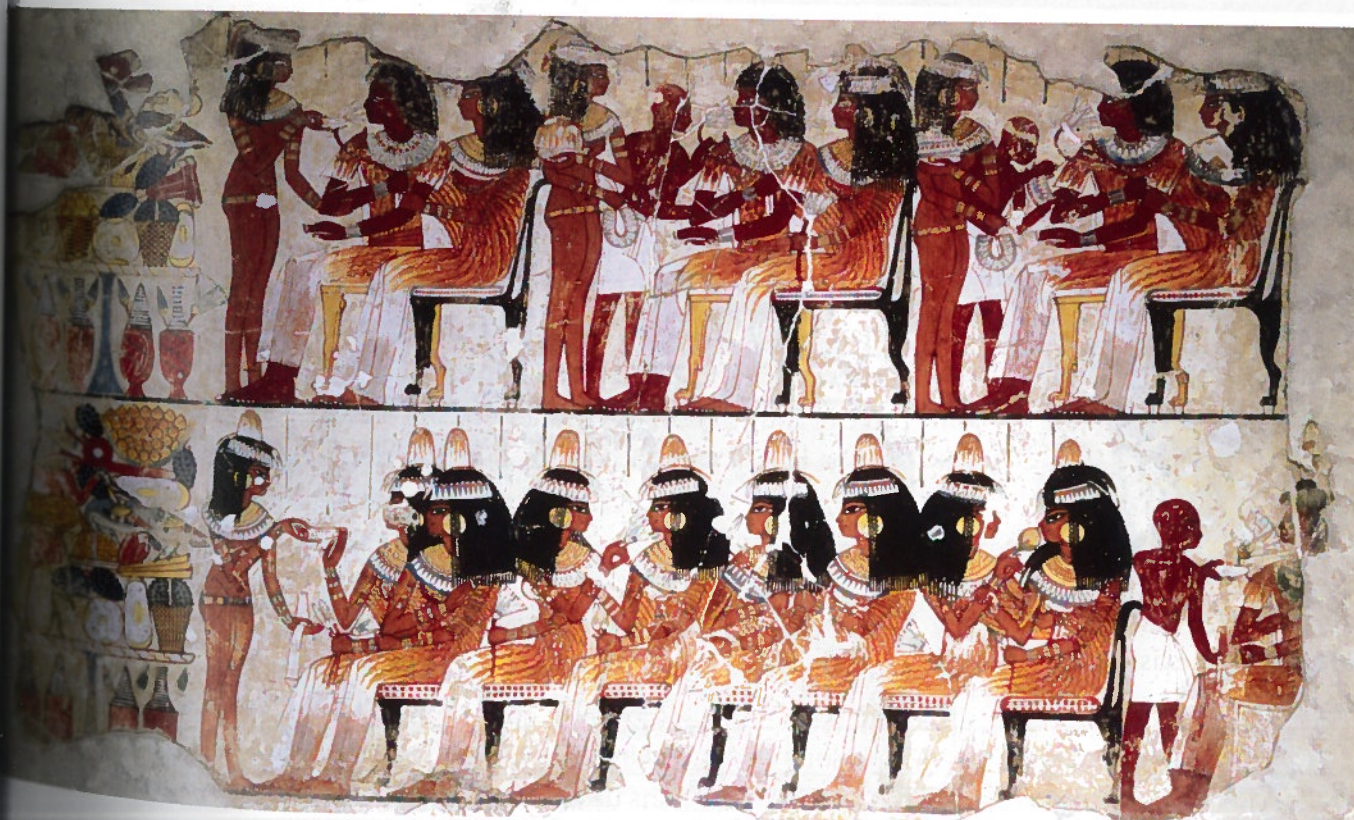
These women of high social class enjoy a banquet.

While the guests ate, musicians, dancers, and acrobats provided entertainment. Musicians were usually women. They played flutes, harps, rattles, and lutes (a guitarlike instrument). Guests often clapped along with the music.