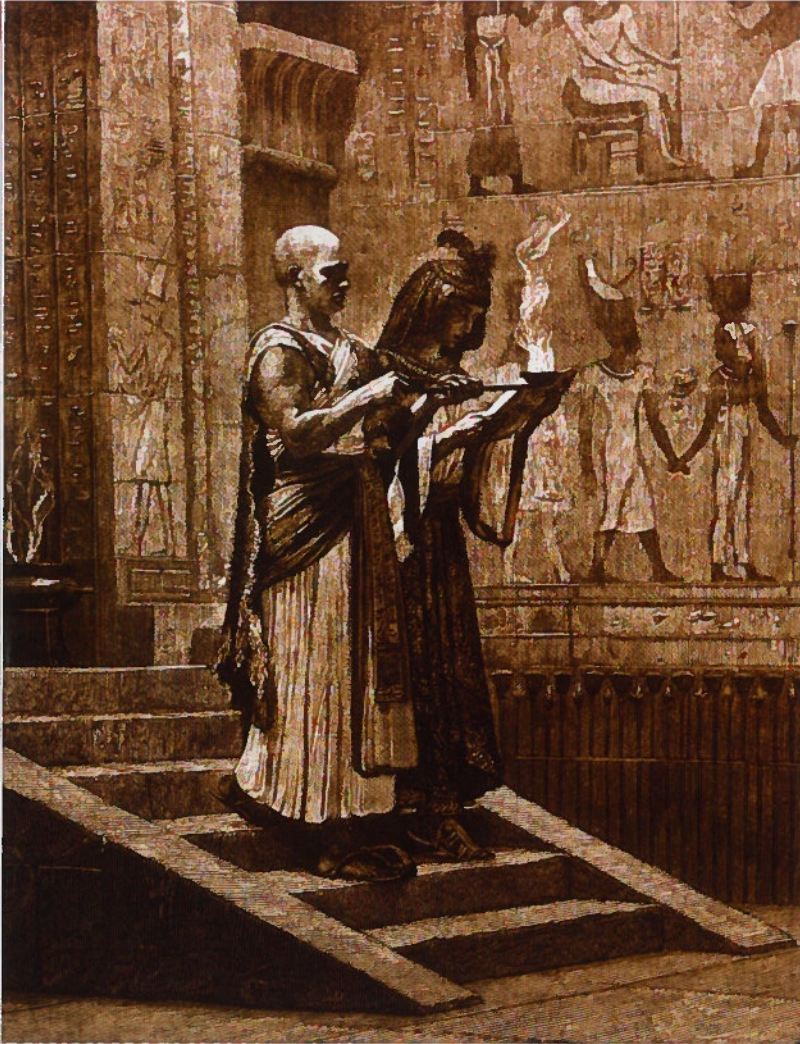
Priests shaved their heads as one of many steps in achieving religious purity.