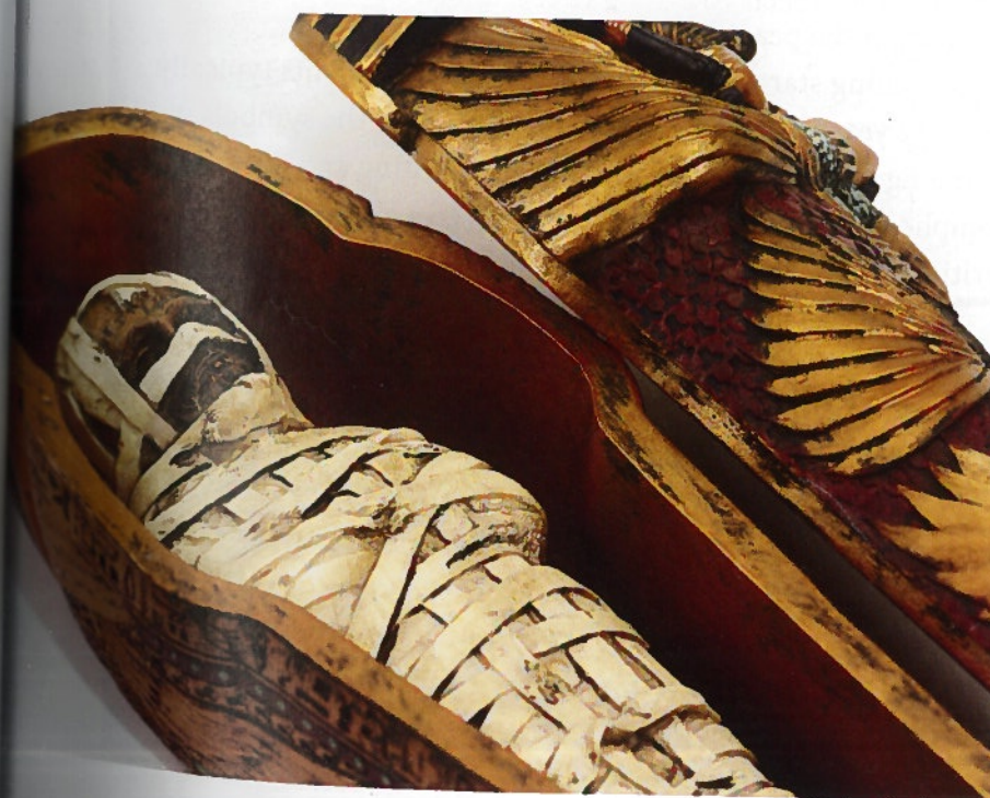
The Egyptian process of embalming a body produced a mummy, such as the one shown here.

Not all Egyptians could afford such complicated burials. But even poor Egyptians wrapped their dead in cloth and buried them with loaves of bread and other items they thought would be needed in the afterlife.