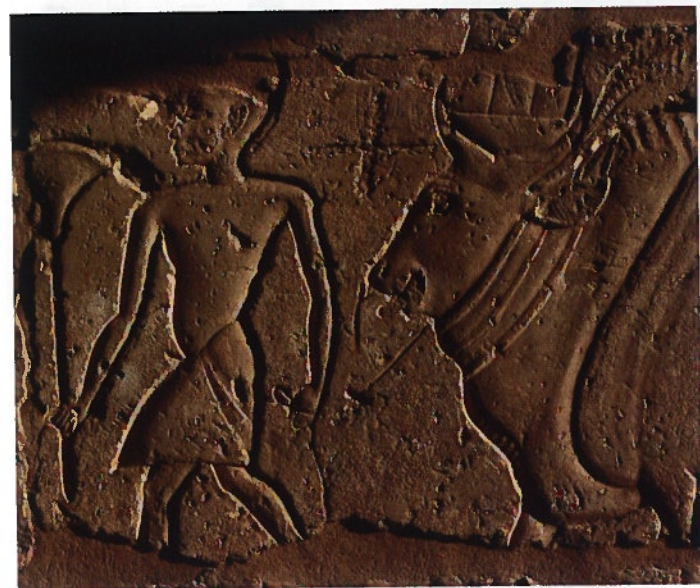
This engraving shows a young peasant with his cow. Peasants worked hard to supply Egyptians with food.

The peasants' diet was also simple. A typical daily meal might be made up of onions, cucumbers, fish, and homemade bread.