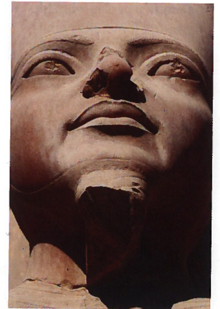
Skilled artisans created this sculpture of the Egyptian sun god Amon-Re.

◀ Festivals brought together ancient Egyptians of every social class.